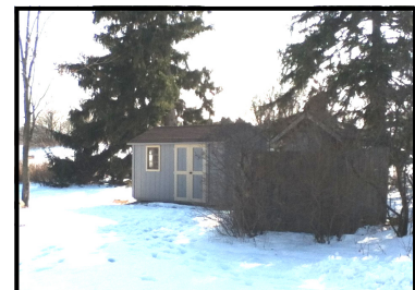
The new shed awaits Spring