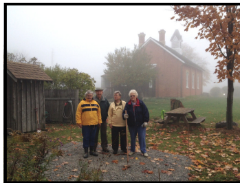
The shed base is done

Meanwhile, in the spring, watch for bursts of yellow everywhere from all the daffodil bulbs that have been planted. They will compete with the dandelions in the lawn!