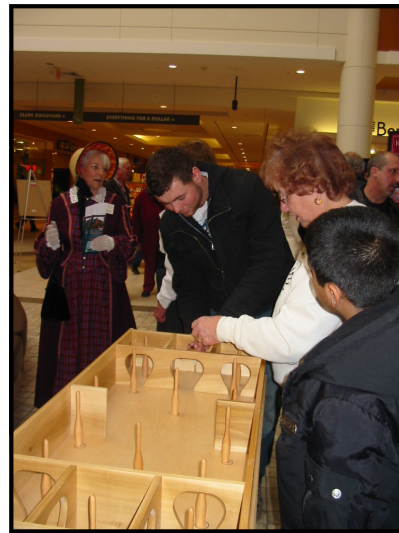
You just hold the peg and pull the string—not so easy!