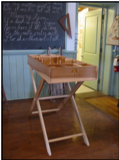
The skittles table

(Weather Person, please arrange NOT to have a snowstorm on or the day before Heritage Day next year!)